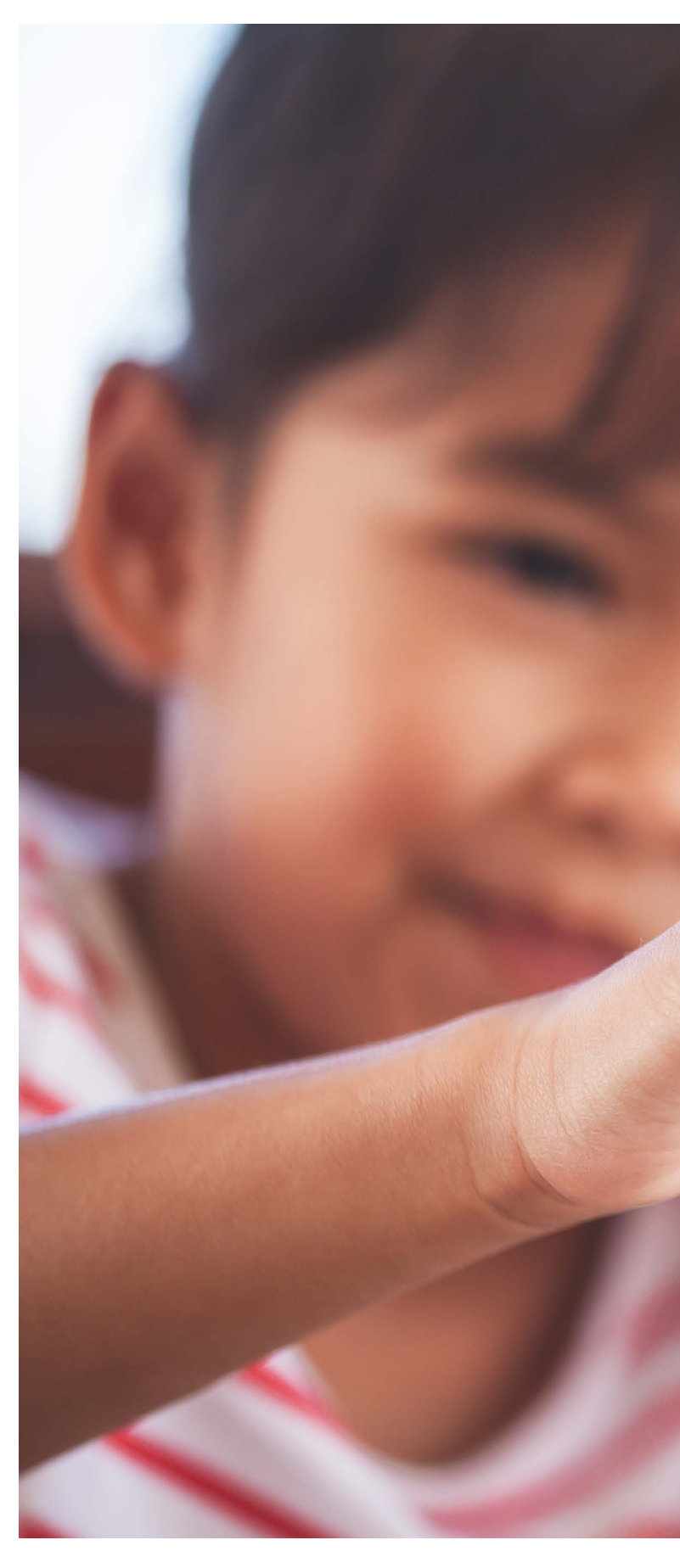
All rights reserved. Reproduction in any form or by any means is not allowed, without prior permission in writing from IHC Merwede Holding BV.